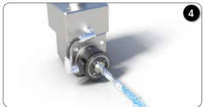
Begin with the internal coolant application