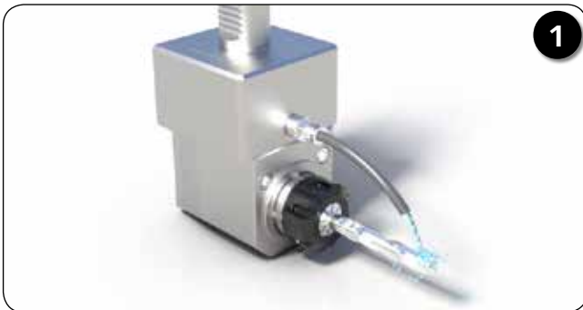
Start with external cooling