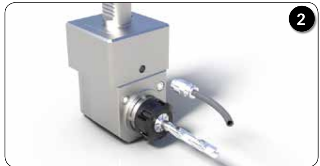
Disassemble coolant pipe, ER nut and cutting tool