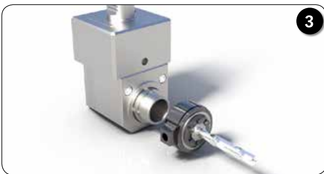
Assemble reCool®, sealing disk and cutting tool